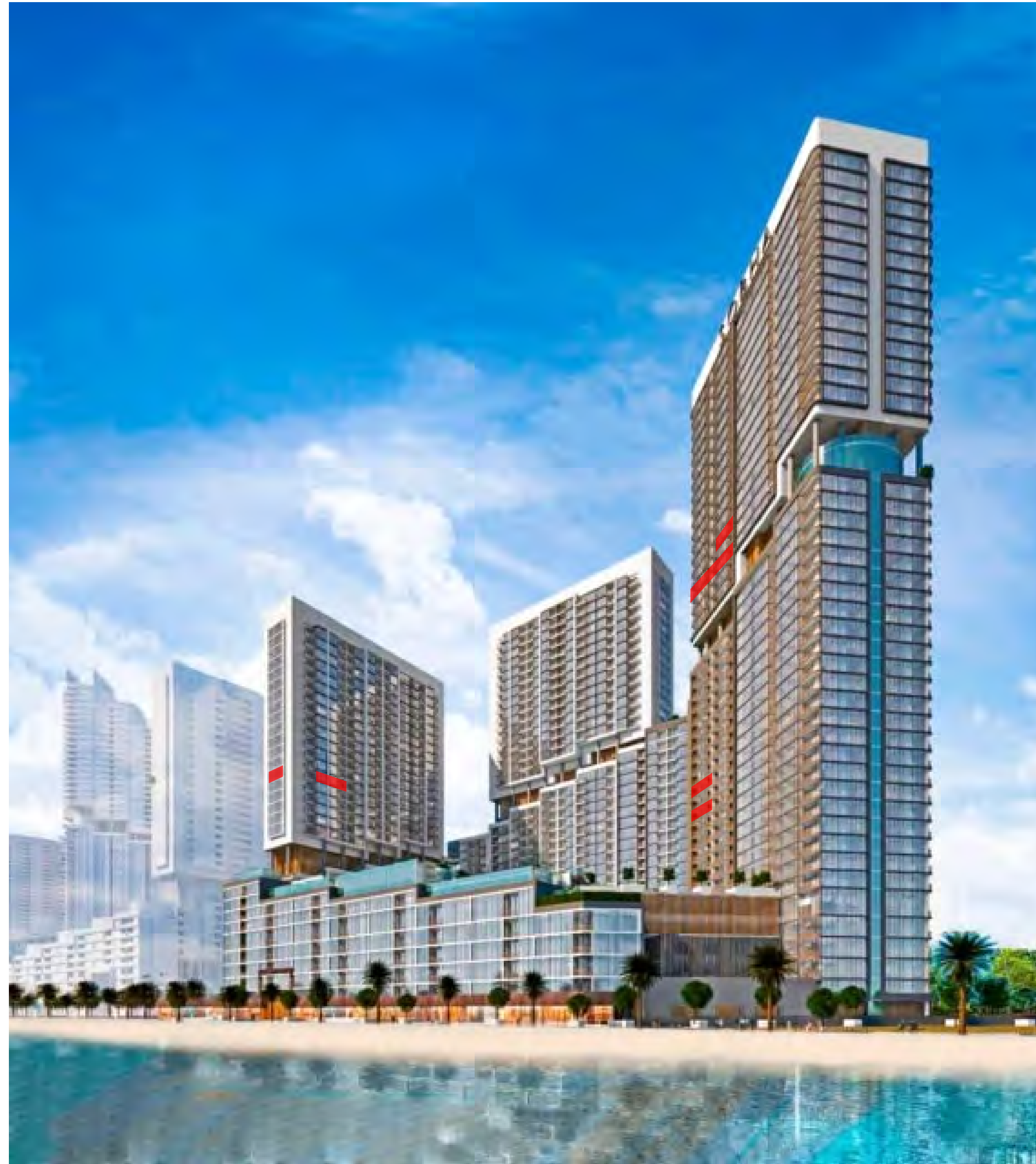
Creek Vistas Grande Delivery date 30.06.2025